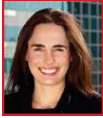
Victoria Lakers The Lancer Group