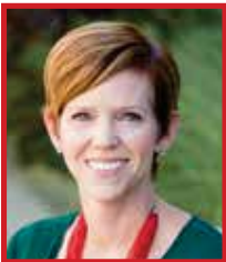
Ariel Bedell Loftin Bedell P.C.