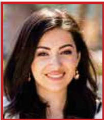
Innesa Burrola Boutique Recruiting