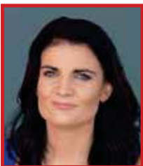
Kelly Duford Williams Company is Slate Law Group