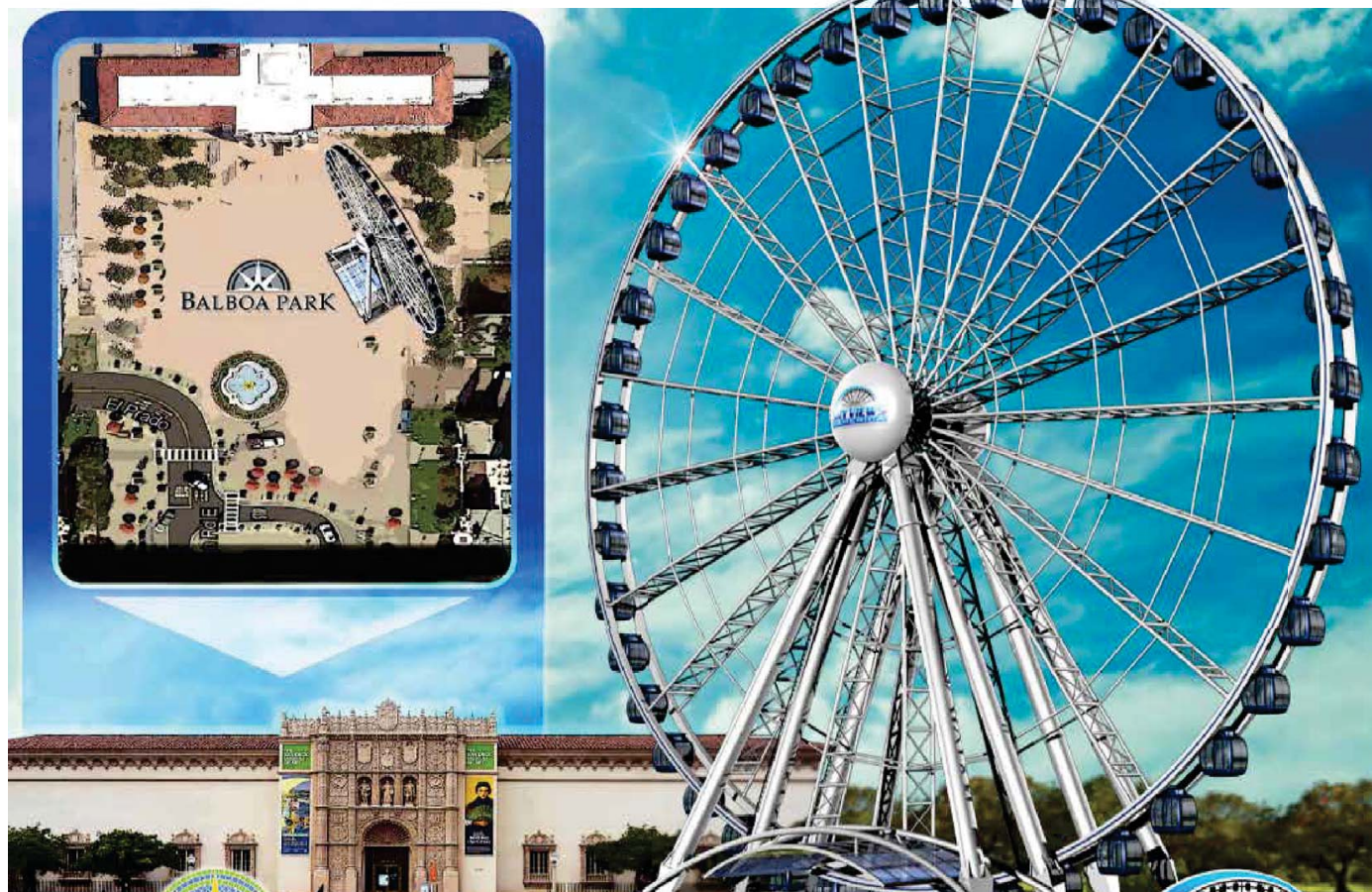
Cohn Restaurant Group is vying to bring a 148-foot tall observation wheel to Plaza de Panama in Balboa Park.